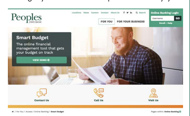
Pull it all together so you can see the big picture

With all this information at your fingertips, you'll be able to create household budgets that will help you reach your financial goals. To sign up, go to Peoples Online Banking and click on the "Smart Budget" tab. Have questions? Give us a call at 888,929,9902.