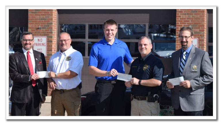
A big thank you to everyone who joined us on Friday, August 10, for our annual brat fry where all the proceeds went to the Rhinelander Police Department, Rhinelander Fire Department, and Oneida County Sheriff Department.