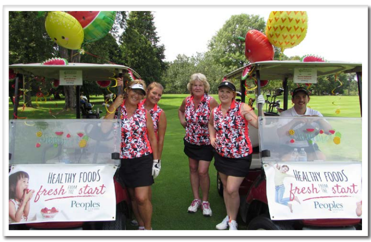
Congratulations to our Peoples team that played in the Aspirus Women's Golf Outing! They tied for first place at the event.